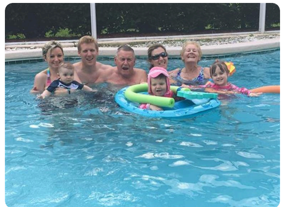
Fun in the Pool