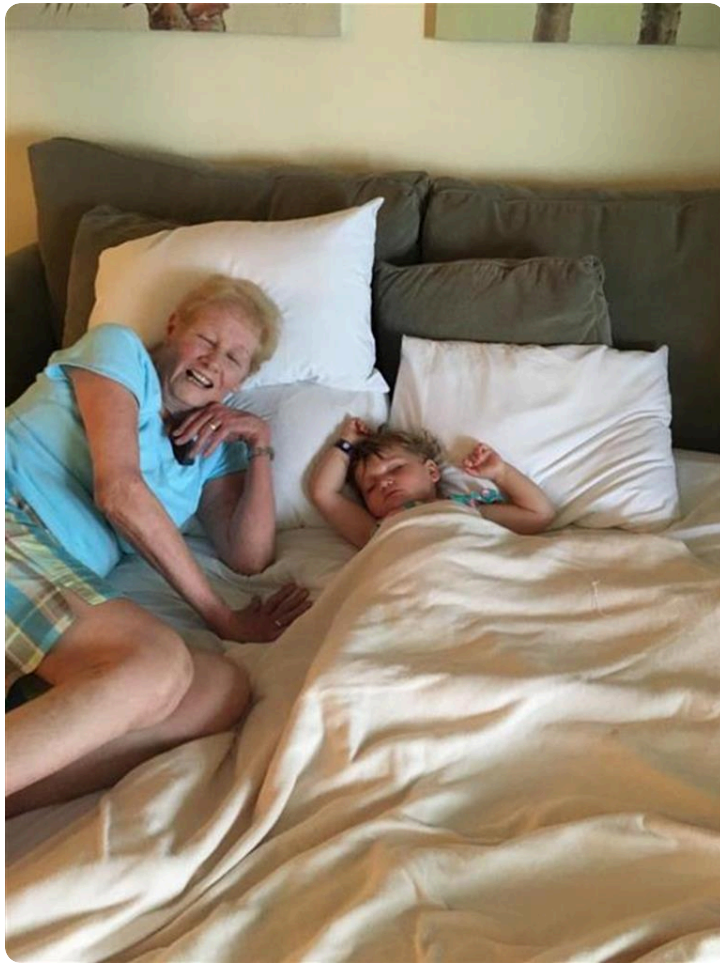
Fun with grandchildren!